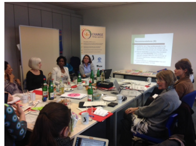
Project partner meeting in Berlin, March 2014